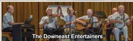
The Downeast Entertainers