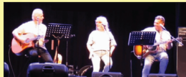
KING WHITE TRIO